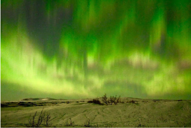
Photo of the Northern Lights from Nome, Alaska.